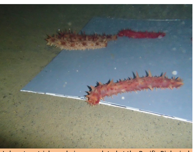
Laboratory trials are being completed at the Pacific Biological Station to see if certain sediment types can act as biological barriers to the movement of juveniles of the California sea cucumber, Parastichopus californicus.

CIMTAN member quote of the month: "A sea cucumber researcher is a plumber by trade, seamstress by default and biology nerd at heart" (CIMTAN summer student Colleen Haddad).